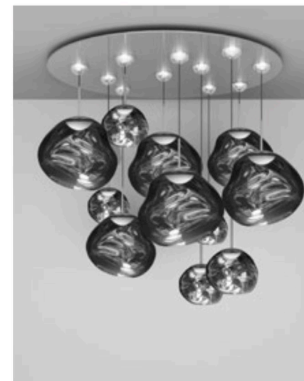
MELT LED MEGA EU

Cluster Diameter 950mm Ceiling Canopy Diameter 580mm Drop from Ceiling 1830mm Weight (Inc Canopy) 15.7kg No. of Boxes 6