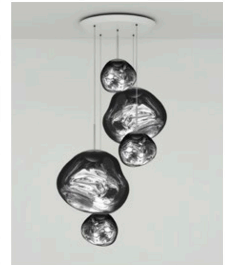
MELT LED LARGE ROUND EU

Cluster Diameter 730mm Ceiling Canopy Diameter 580mm Drop from Ceiling 1400mm Weight (Inc Canopy) 12.9kg No. of Boxes 6