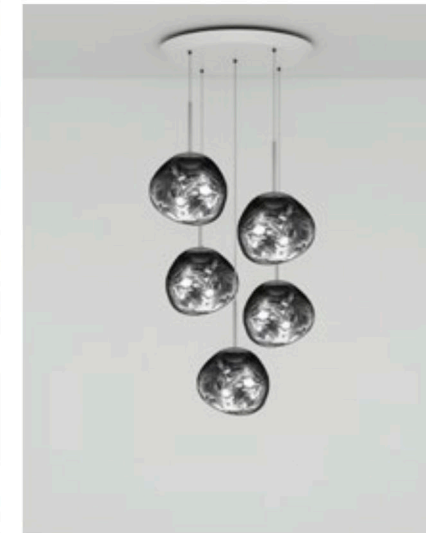
MELT LED MINI ROUND EU

Cluster Diameter 810mm Ceiling Canopy Diameter 580mm Drop from Ceiling 1410mm Weight (Inc Canopy) 11.18kg No. of Boxes 4