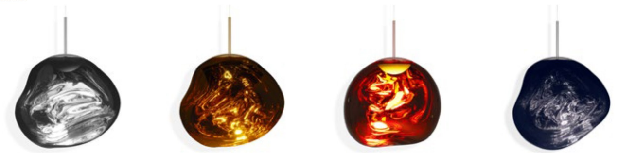
Chrome Brass Copper Smoke